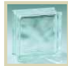
Premiere Series, DECORA® Pattern